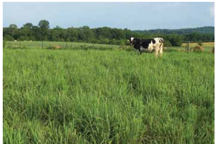
Fig. 9. Maintaining proper grazing pressure will result in grass canopy heights between 15 and 20 inches tall, an ideal situation for maintaining high-quality forage and vigorous NWSG stands.

This approach involves monitoring the height of your pastures once a week or perhaps once every two weeks and adjusting the number of animals as needed to maintain the proper grass height (Fig. 9). When the grass in your pasture drops below 15 – 18 inches in average canopy height, remove some animals to reduce grazing pressure. On the other hand, if it gets above 20 to 24 inches in average canopy height, be prepared to increase stocking rate. If you use this approach, you need to have additional pasture of some type to be able to hold the animals you have pulled off the NWSG. The key is to regularly observe your pastures and know their condition so you can anticipate adjustments. With some experience, you should only have to make minor adjustments. For example, following the guidelines provided below for stocking rates, only two or maybe three adjustments will be needed all summer to manage bluestems or indiangrass. Switchgrass, on the other hand, may require more frequent adjustments, especially early in the season when growth is most rapid. In terms of numbers to adjust, generally you will only need to increase or decrease by about 20 percent at any given time.