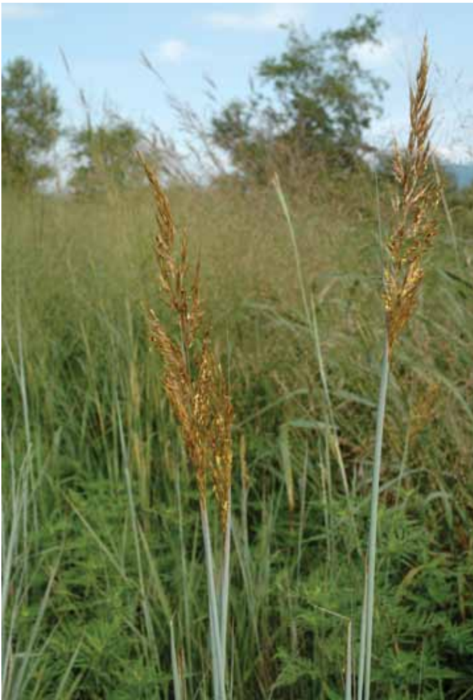
Fig. 5. Indiangrass can be recognized by its pale green stems and golden head. The seedhead appears in August, later than the other NWSG.